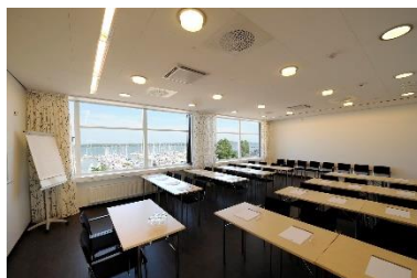
Ramsö, classroom style