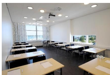
Husö, classroom style