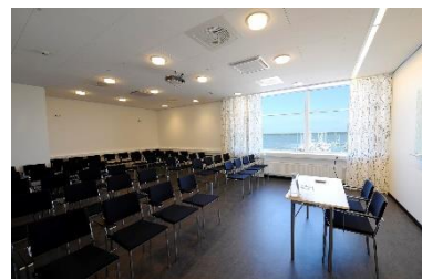
Fiskö, theatre style