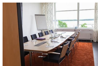
Hästhalm / Bockholm