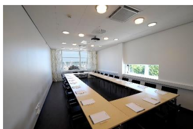
Saggö, hollow square